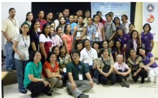
All teachers and organisers after the opening session

The course for the global project Young Ambassadors for Chemistry (collaboration between SAW and the International Union of Pure and Applied Chemistry) was successfully held in Manila, the Philippines on April 12-14, 2010.