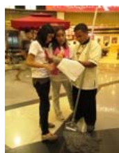
Roving reporters interview a cleaner, while a fellow student in the group produces shampoo