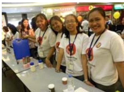
More branding: our coordinators of chemicals in their YAC T-shirts