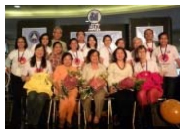
All organisers, jury, trainer and evaluator handing and receiving presents