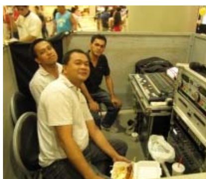
ShoeMart (SM) provided us with real disc jockeys and real spotlights!

We face only one 'problem', for safety reasons the circular working space is fenced (about 1 m high), with only a small entrance for the public. All students, teachers and organisers wear a wonderful YAC T-shirt with the YAC logo and a YAC button . We are clearly audible: Nori Tansio, our lady speaker and 3 disc jockeys make a lot of 'noise' and also clearly visible: branding with YAC balloons and spotlights on the stage from behind the fence and from the higher floors around the open space. Everything goes smoothly with students, teachers, chemicals and stationary! The