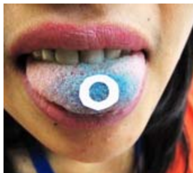
'Count your number of taste buds and collect data from all groups'

Next comes the taste bud practical (group)work (from the SAW topic 'Talking about Genetics'), that generates a great deal of hilarity and the presentation of the (creative) statistical group results.