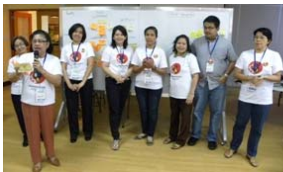
What could we have done without the YAC organisers from PACT?

After the break (with wonderful food, being common practice during all coming breaks) we introduce YAC (the nice example of our last YAC event, the Cyprus clip about the YAC event on YouTube, is sadly blocked, because of school policy) and SAW .