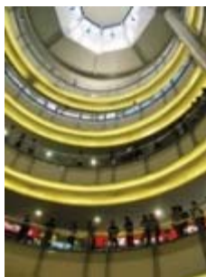
ShoeMart Shopping Mall in Metro Manila