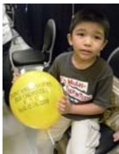
Branding: young visitor with YAC balloon