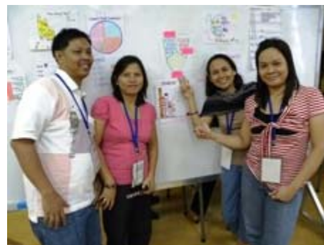
'Represent the collected data in a creative graphical design'

After the coffee break we start the practical demonstration for the workshop on cosmetics. The teachers show a lot of interest in the chemical and generally speaking in scientific backgrounds. We promise to organise an 'academic' lecture with PowerPoint presentation (available now for all participants on 'our' website) on the Wednesday morning.