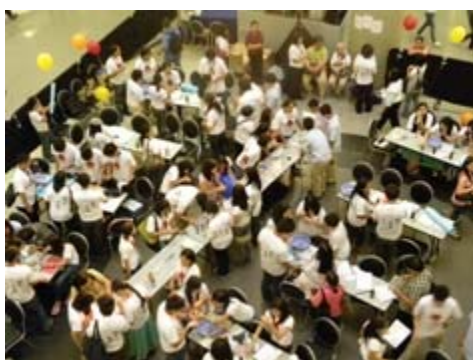
Aerial view on the YAC event showing all students, teachers and organisers