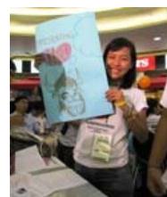
Creative new YAC brand