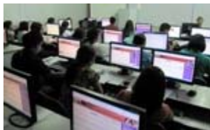
Web quiz on the computers of Asia Pacific College